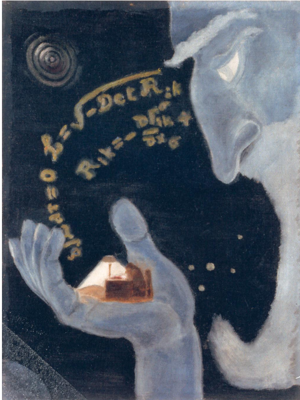
Figure 1. J. L. Synge's painting 'Schrödinger in the Hand of God'. (Online version in colour.)

Cycling, walking, swimming and sailing were the main hobbies that Synge was to pursue passionately throughout his life. Cycling, especially, formed an integral part of his life, both as a form of recreation and as an object of dynamical investigation. Later on in his life he took up painting with some considerable success (figure 1). Well after retirement he tried his hands on the mandolin, but without much success.